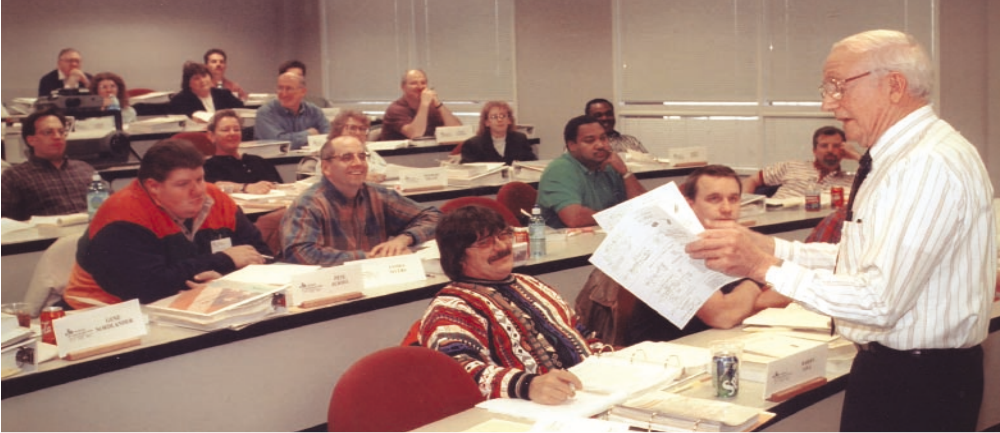
An instructor at the National Safety Education Center brings safety and health training to DeKalb, Ill.

education centers enable OSHA to significantly expand its outreach without requiring additional funds or resources.